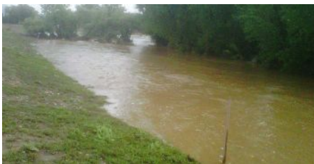
Flooding of Boulder Creek about a mile west of us. Somewhere under that is the bike path

Another great part of the story was the fact that not only did the helicopters and rescue crews evacuate people, they evacuated their pets.