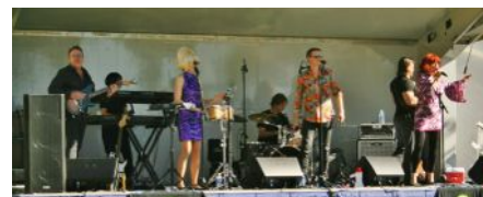
'Hey Lady' performing onstage

Longmont Humane Society held their 'Strut Your Mutt' event a little late this year due to the rain and flooding in September. The event was held at the Boulder Valley Fairgrounds in Longmont.