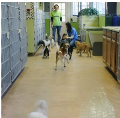
The girls and pups playing in the Blaze

The small dogs have two play areas devoted to them. The one you see on entering the kennel in the front and another on the back of the building. The rear play yard allows access to the large indoor small dog kenneling room that we call the "Blaze."