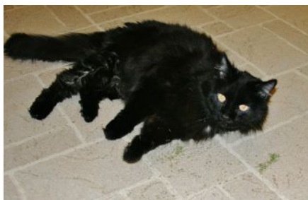
Chester enjoys a roll in the catnip

Chester is a fluffy black guy and was the oldest of the bunch at seventeen years. His first stay was in 2006. He loves rolling in cat nip, taking sun baths, and getting lots of love.