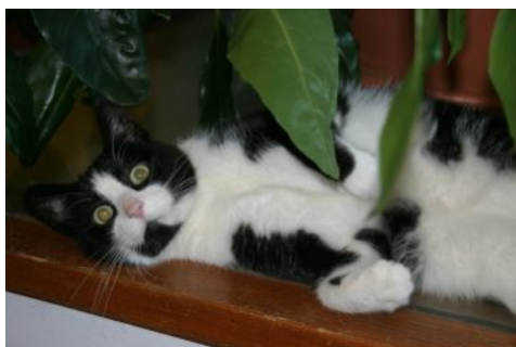
Romeo lounges amongst the plants

Romeo is a sweet and lively guy who enjoys playing with toys and watching the birds. He would stop for a few quick pets and then zoom away.