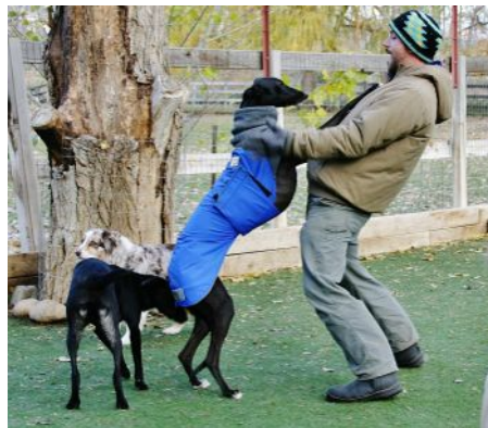
Full coats help the dogs stay warmer

It is advisable to bring your dogs coat in with them. We do have a supply of coats we will put on them if we think they need it. We also have a fashionable supply of dog coats for sale in the lobby if you would like to get one for your dog.