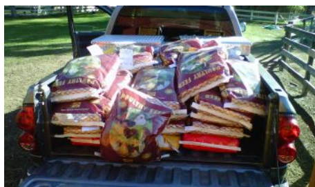
A truckload of chicken food, Lay crumbles and seed scratch to keep the hens laying

But here in Colorado where the ground is covered in white a good part of the time and the cold makes that food unavailable, then we must step in to help.